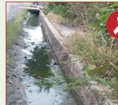
Drains, Ditches and Depressions

Checklist provided by the BVI BugOut Program.