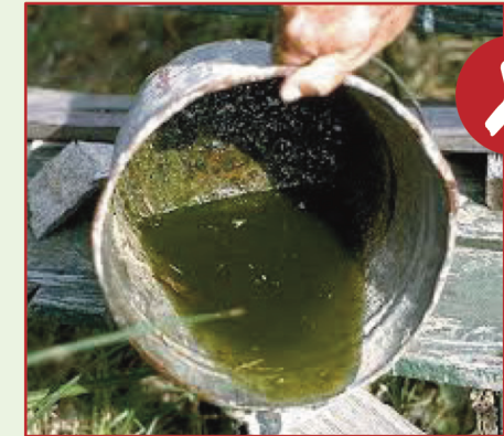
Buckets and Pails